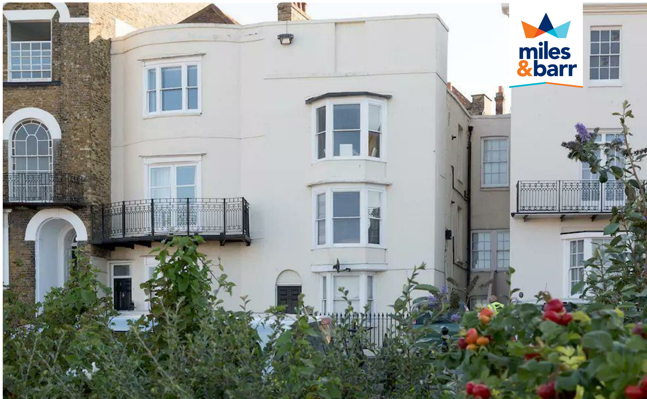
7 FLAT 3 ALBERT TERRACE MARGATE